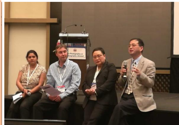
FOP WORKSHOP Q&A SESSION